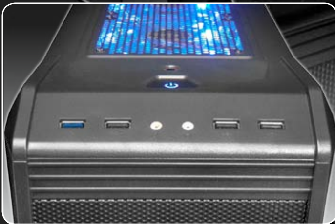
· Top panel: 3 x USB 2.0 & 1 x USB 3.0 + HD audio and Mic