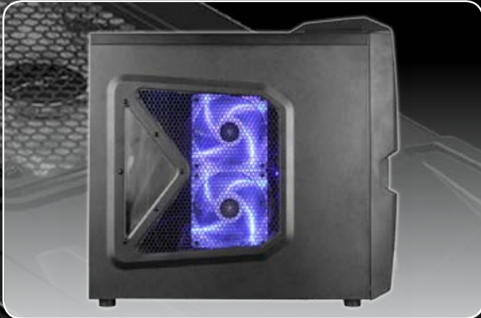
· Side panel with 2 x 120mm Blue LED fan