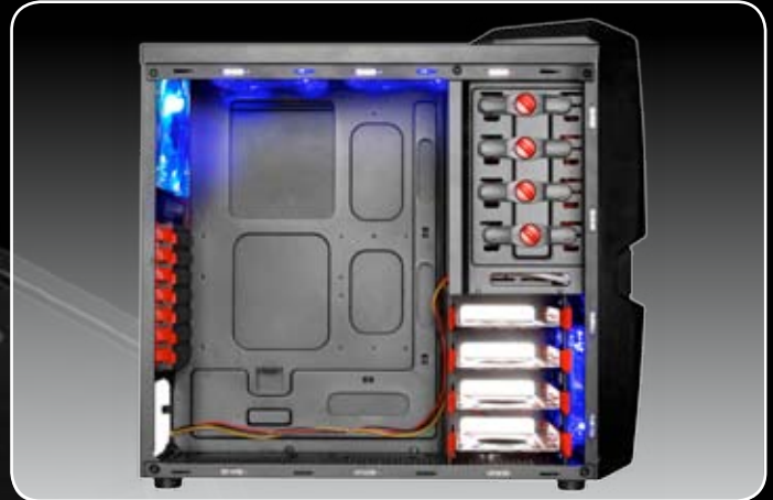
· Hidden Cable Management