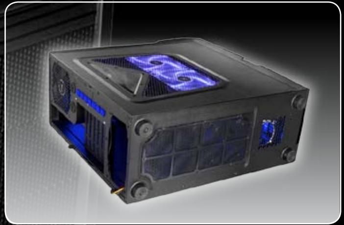
· Removable Dust Filter