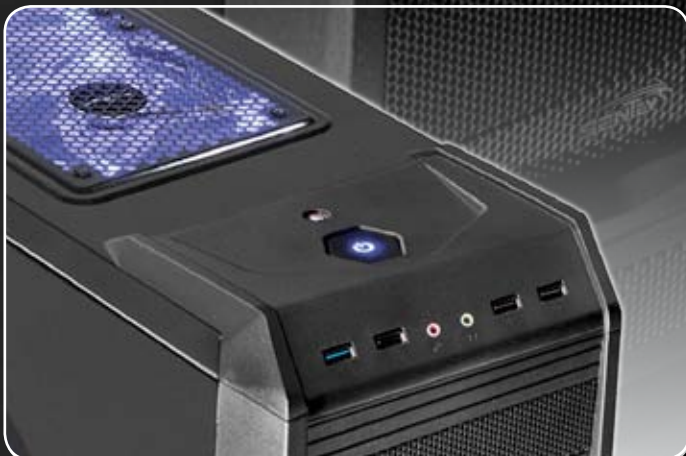
· Exclusive Topcover Design